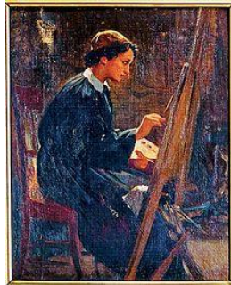
Self Portrait of Eleni Boukoura, Born 1821, Spetses

https://en.wikipedia.org/wiki/Eleni_Boukoura-Altamura