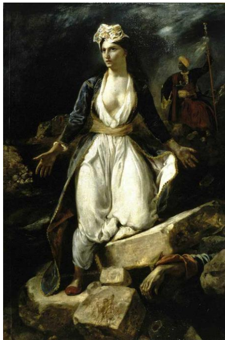
Η Ελλάδα στα ερείπια του Μεσολογγίου – Ευγένιος Ντελακρουά

Anargyrios & Korgialenios Foundation Estate